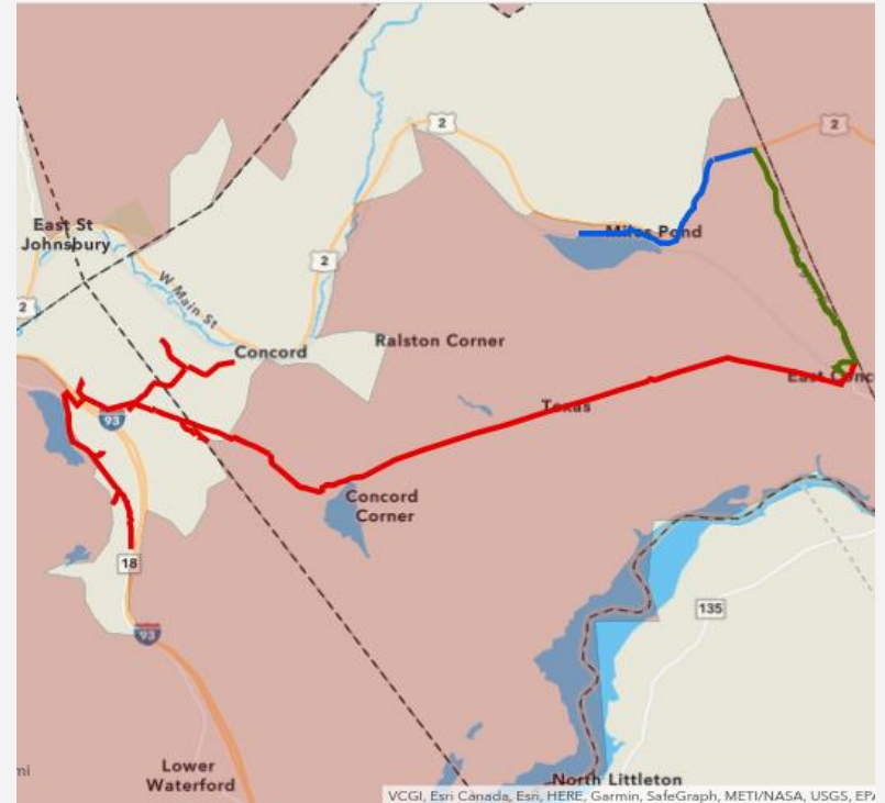
Light green – USDA eligible borrowing area